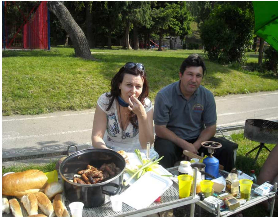
Fiserman Assosiaton at a City beach