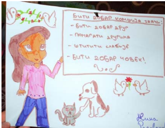
TO BE A GOOD NEIGHBOUR MEANS: