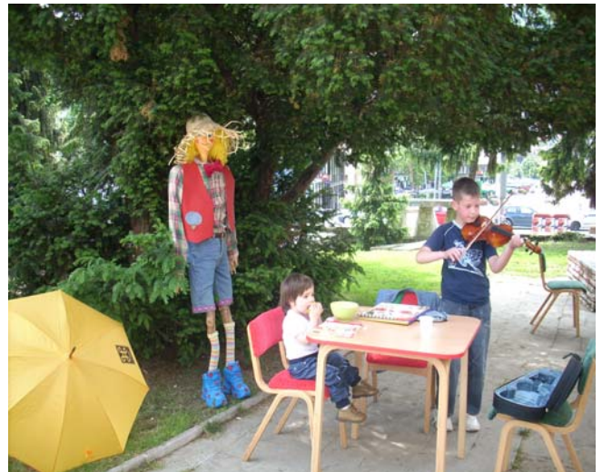
Corner in front of the National Library