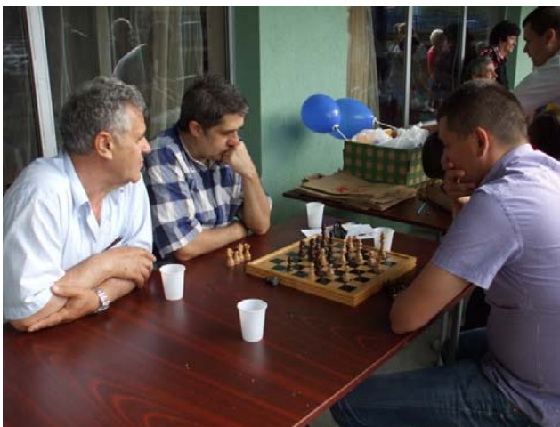
Another corner was reserved for senior citizens, who played chess, cards and dominoes. In the spontaneous and relax atmosphere, with juice and coffee they stayed till 8:00pm.