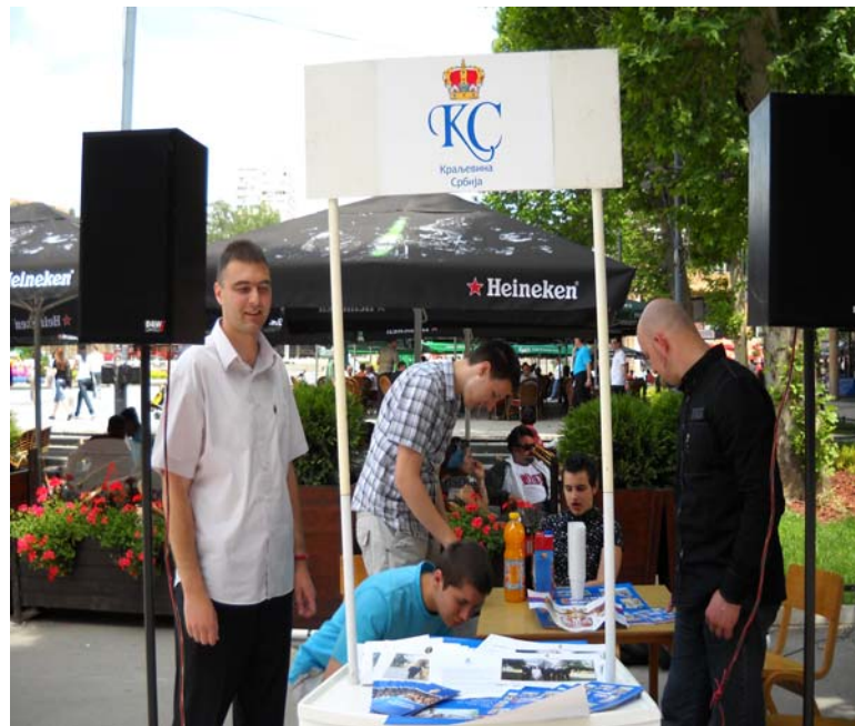
Association 'Kingdom of Serbia'

Association 'Kingdom of Serbia' for this occasion had its booth, where they were handing out promotional materials, balloons for 30 children, candies and refreshment. In the relaxed atmosphere neighbours who were passing by listened to the nice music, chatting and had a lovely time.